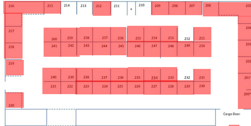
#16 Placer Building