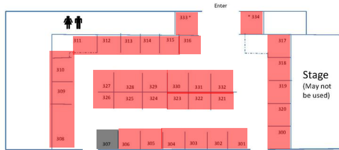
#5 Sierra Building Includes basic electricity * = No pipe, drape or electricity

500 watts electrical included in all indoor excluding foyers, harvest fest & concessions.