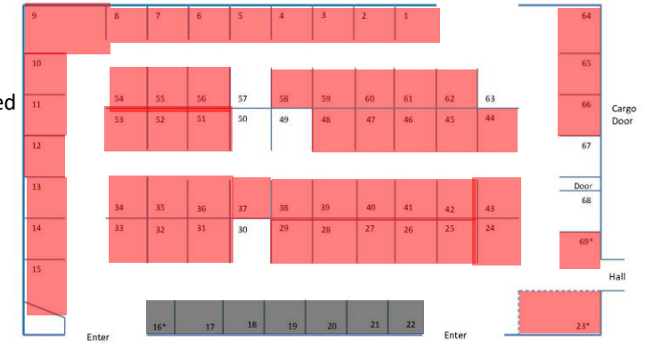
#10 Armory Building

500 watts electrical included in all indoor excluding foyers, harvest fest & concessions.