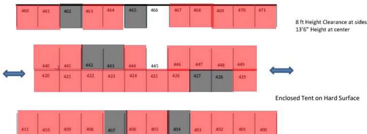
#18 Courtyard Pavilion